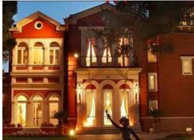
Venue: Villa Romanazzi Carducci

The ultimate objective of the course is to increase knowledge among participants on how to use independently the management tools provided. The course foresees lectures and group work. Additional material will be provided through Webinars available on the Mattone Internazionale Project.